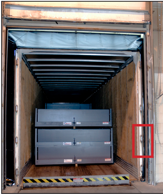
Full Access to Trailer Door Opening