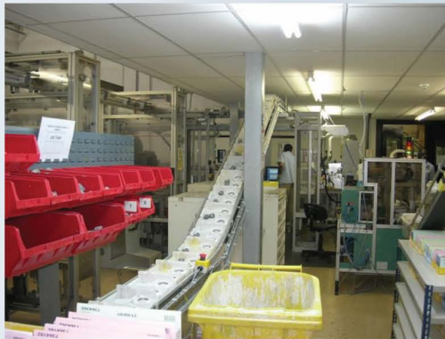
Friction Chain Decline up to 25°