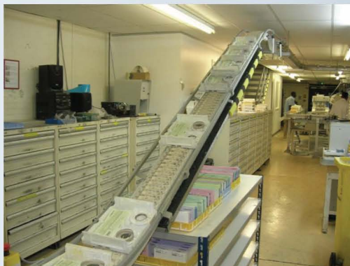
Friction Chain Incline