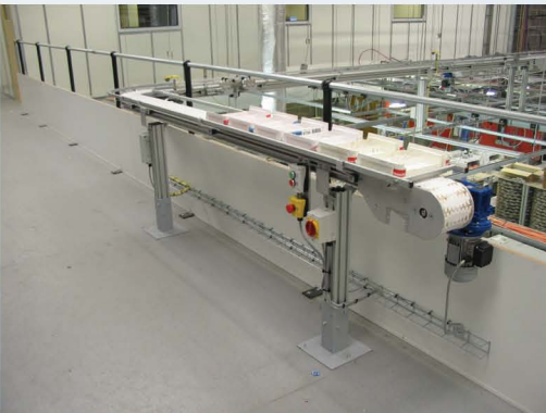
Feed onto Mezzanine Floor