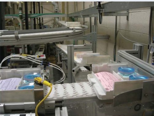
Side Push Unit