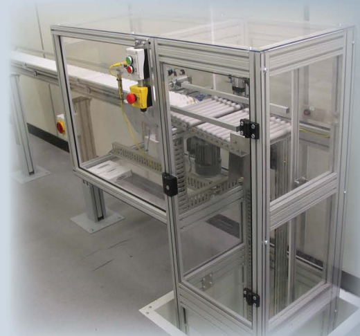
Mezzanine Floor Lifter